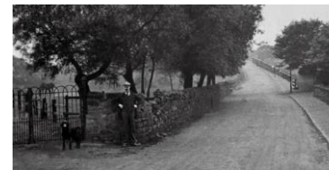
Looking up Mill Lane towards where Mill Brow and Sutton Mill was located. 1900 vs Now.