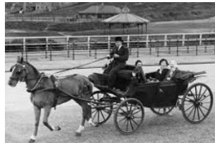
horse and carriage